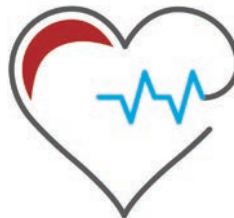
Medical Care for Chronic Conditions