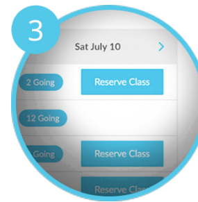
3 Reserve a Class