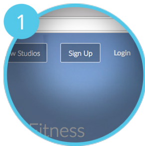
1 Create Your Peerfit Account