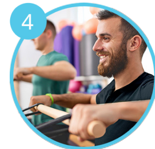
4 Show Up & Work Out