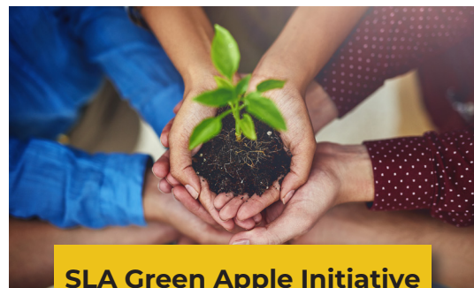
SLA Green Apple Initiative

As a family-owned company, we treat our team members, students, and school communities as an extension of our own SLA family. Our team loves what they do and are eager to greet your students daily and support them throughout their educational experience. We promise to watch over your family and feed them as if they were our own.